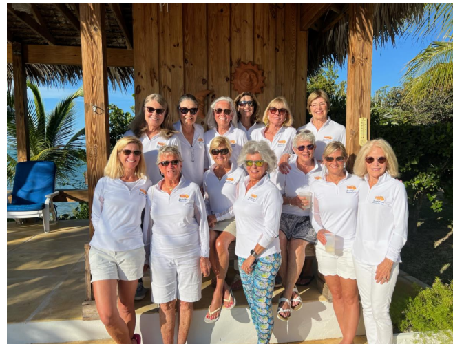
The official "Mangrove Cay 2022" portrait.