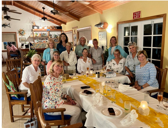
The Farewell Dinner