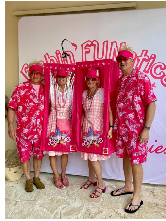
"Matador" Barbies & Kens