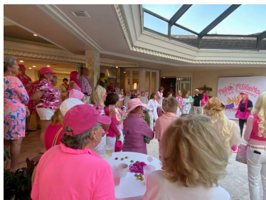
A Sea of Pink